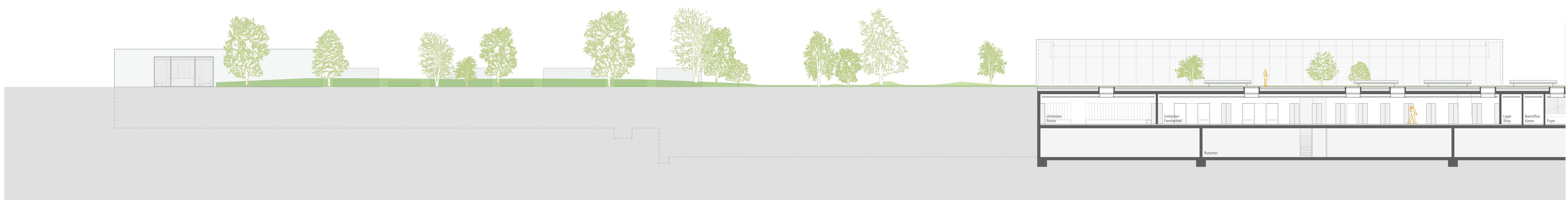
Schnitt D-D M1:200